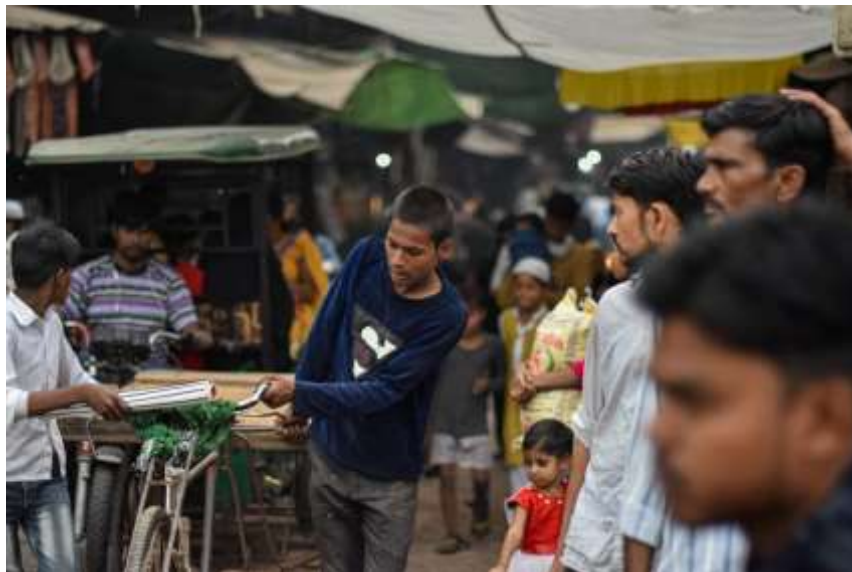
Bazar in a Muslim Mohallah, Firozabad, Uttar Pradesh.

With the support of SEARCH (University of Strasbourg), LINCS (University of Strasbourg) and LAVUE (University Paris 8)